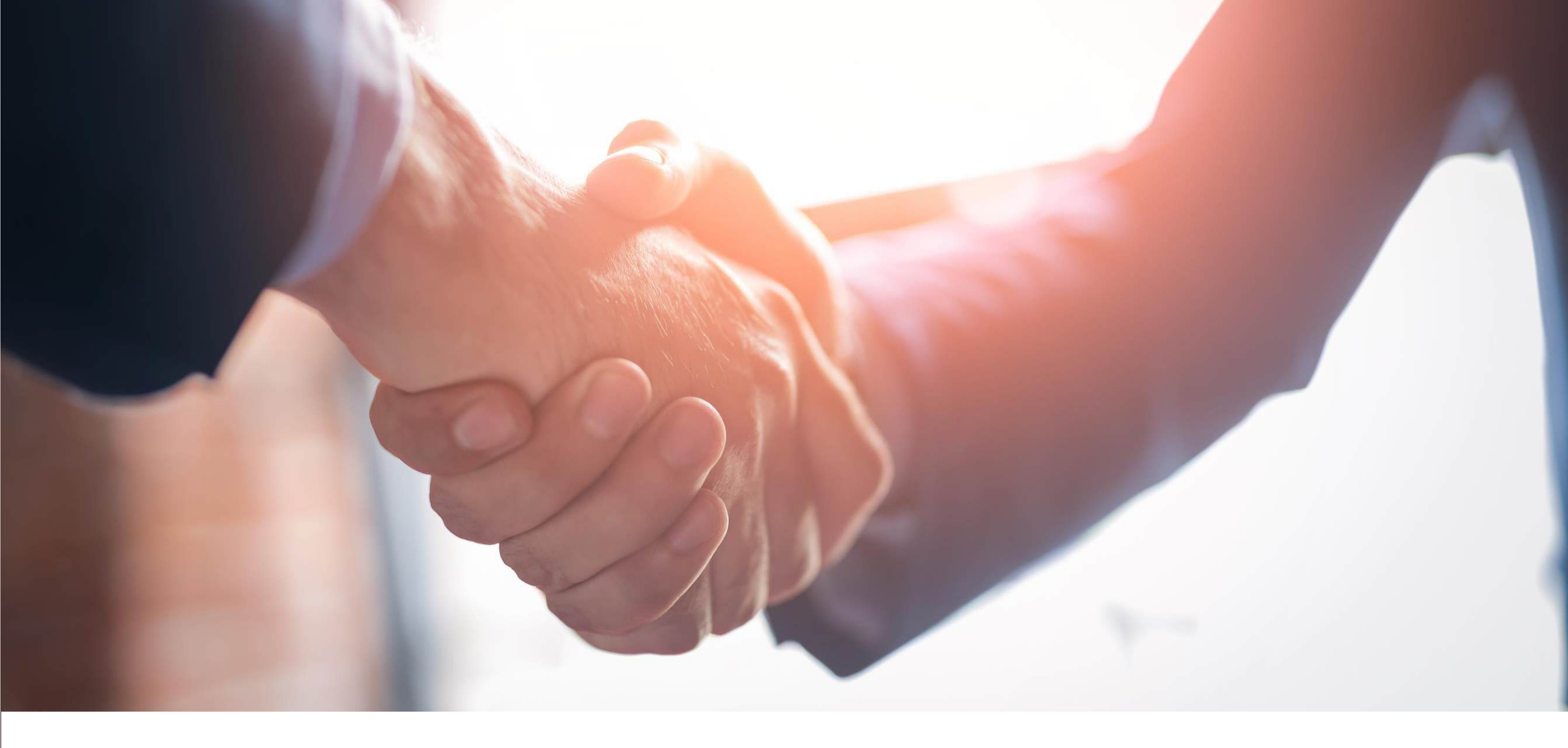
Someone who BELIEVES in my vision.